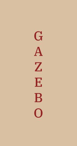
G A Z E B O