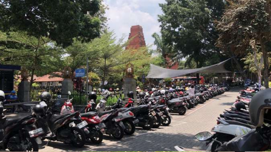
P L A R K I N G